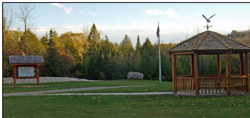
Fish Creek Park